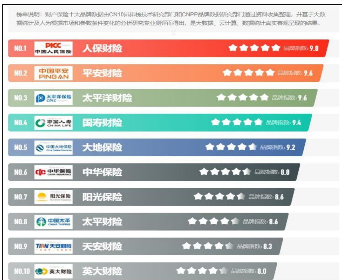
Figure2 CN10 / CNPP Top ten brands of property insurance in 2021