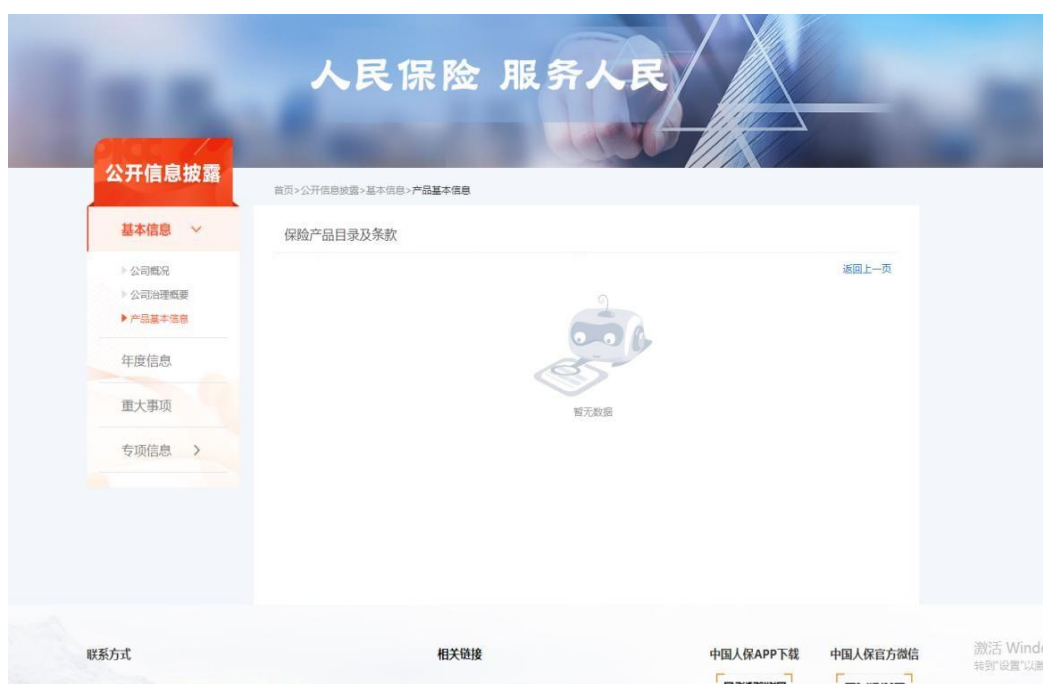
Figure5 After the environmental pollution liability insurance of Shanxi Province (version 2020) is clicked, it displays "no data temporarily"

Given the above situation, PECC sent friendly tips to five insurance companies by letter on July 27, July 28, August 24, and August 26, 2021, respectively. Among them, Taiping property insurance returned the pieces on August 9 due to the unknown recipient. On September 8, PECC received an email reply from PICC P & C, saying that it was grateful to PECC for its reminder. The front end of the two insurance terms mentioned in the letter showed no data because the system was not updated in time. At present, PICC P & C is stepping up system optimization, The latest environmental pollution liability insurance (Section B) (2019) of PICC Property Insurance and the environmental pollution liability insurance of Shanxi Province (2020) are attached to the email. As of the release of the report, PECC has not received any reply from the other four insurance companies.