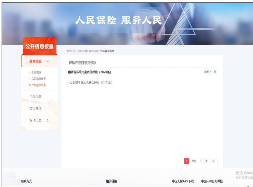
Figure4 Shanxi Environmental Pollution Liability Insurance (2020 version) is included in the basic product information