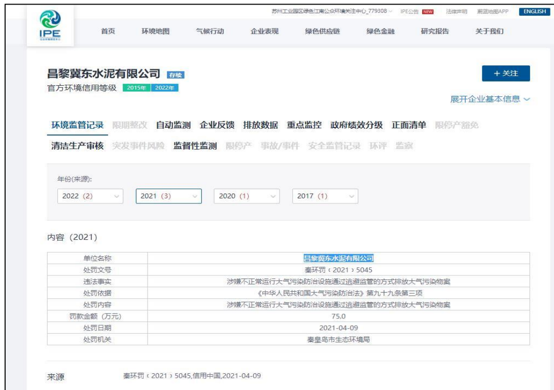
Figure 20 Enterprise supervision record