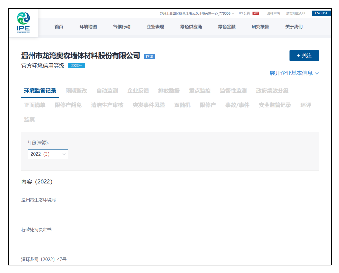
Figure 2 Wenzhou Longwan Aosen Wall Material Co., LTD. Environmental punishment

government at or above the county level to make corrections and be imposed a fine of not less than 10,000 yuan but not more than 100,000 yuan; (2) For materials that are prone to generating dust that cannot be sealed, do not set a tight enclosure not lower than the height of the pile, or do not take effective covering measures to prevent dust pollution "provisions.