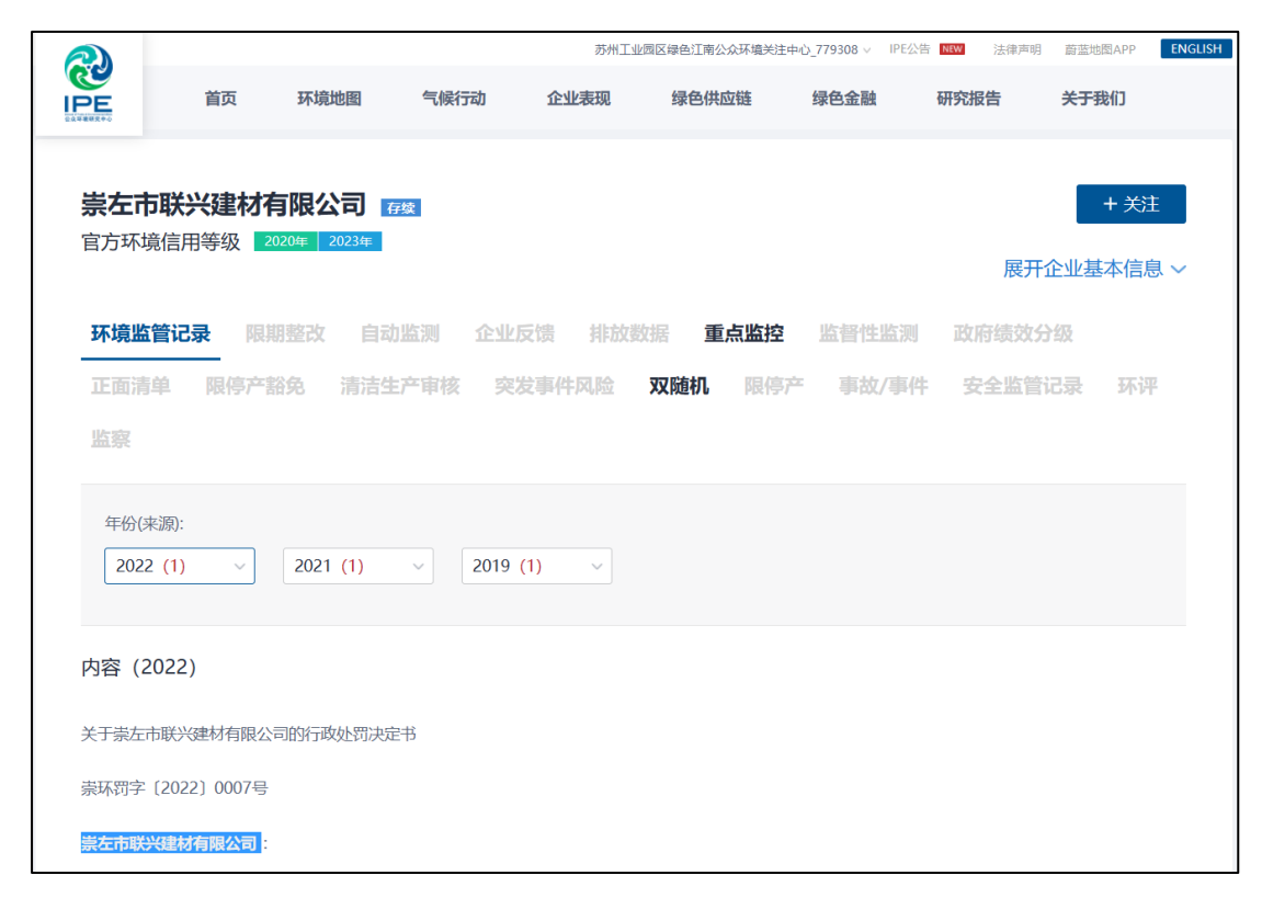
Figure 1 Chongzuo City Lianxing Building Materials Co., Ltd. environmental punishment

Wenzhou Longwan Aosen Wall Material Co., Ltd. was fined 35,400 yuan by the local ecological environment department for excessive noise emission and failure to take cover measures to prevent dust pollution from construction waste piles that are prone to generating dust. According to Article 75 of the Law of the People's Republic of China on the Prevention and Control of Noise Pollution, "whoever, in violation of this Law, discharges industrial noise without a discharge permit or in excess of the noise emission standards shall be ordered by the competent department of ecological environment to make corrections or restrict production or stop production for rectification, and shall be fined not less than 20,000 yuan but not more than 200,000 yuan; If the circumstances are serious, it shall be reported to and approved by the people's government with the power of approval and ordered to suspend business or close down." Article 117 (2) "Whoever commits any of the following acts in violation of the provisions of this Law shall, in accordance with their functions and duties, be ordered by the competent department of ecology and environment of the people's